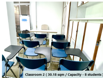
Classroom 2 ( 30.18 sqm / Capacity - 8 students )